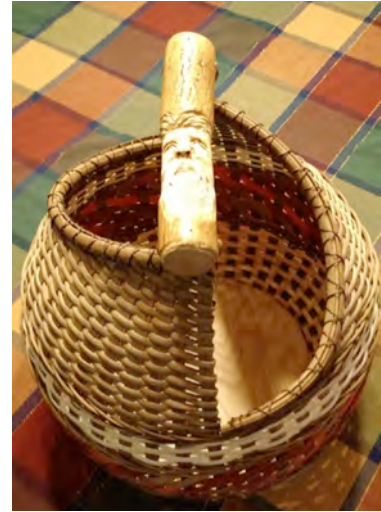
Shown with "Spirit of the Woods" Handle

I designed this basket to showcase the "Spirit of the Woods" hand-carved wooden handle. It is started with a 10" slotted base and smoked spokes. You will learn the triple arrow weave and French Randing with space dyed flat reed. The highlight of this creation is the unique swirled decreasing top to which the handle is attached. You will create a beautiful basket that truly is one of a kind!